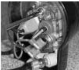
Figure 25 (External Power Supply) Loosening lamp retention screw

⚠ It is EXTREMELY IMPORTANT that the unit be unplugged before servicing. The Sterilight Point-of-use unit contains a high intensity ultraviolet lamp that can damage tissues in the eye. The UV wavelengths cannot travel through the plastic housing. However, the lamp will be exposed during removal and replacement. In addition, it is possible to encounter hazardous electrical energy when removing the protective bottom cover. DO NOT PROCEED WITHOUT UNPLUGGING THE UNIT!